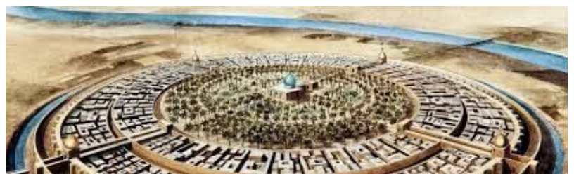
An artist's impression of Baghdad circa 900 AD